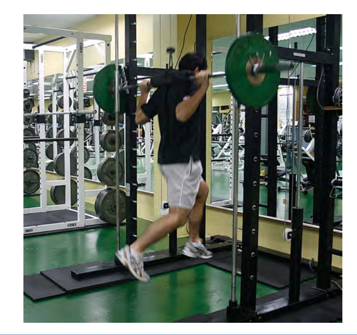
Figure 2. Smith machine split squat. Start in a split stance and perform a countermovement (hamstrings approximately parallel) to explosively jump into the air as high as possible. Switch legs after completing the required number of repetitions.

Resistance training can also benefit the badminton player to maintain optimal posture and body control when executing shots. Body control is crucial for the execution of an accurate shot. Athletes with poor body control can be seen collapsing at the trunk during front court lunge shots which not only hinders optimal execution of the stroke but also delays the athlete from returning to the ready position in mid court (center of gravity is further forward and away from body when the trunk is collapsed forward). The ability to decelerate is an important factor for body control in the lunge. Deceleration may be even more important than acceleration because it plays a role in changing direction, cutting, stopping, and transitioning from one move or play to another (7). Resistance training exercises we implement to improve body control and deceleration include the 3-phase lunge (Figure 5) and cable lunge decelerations (Figure 6).