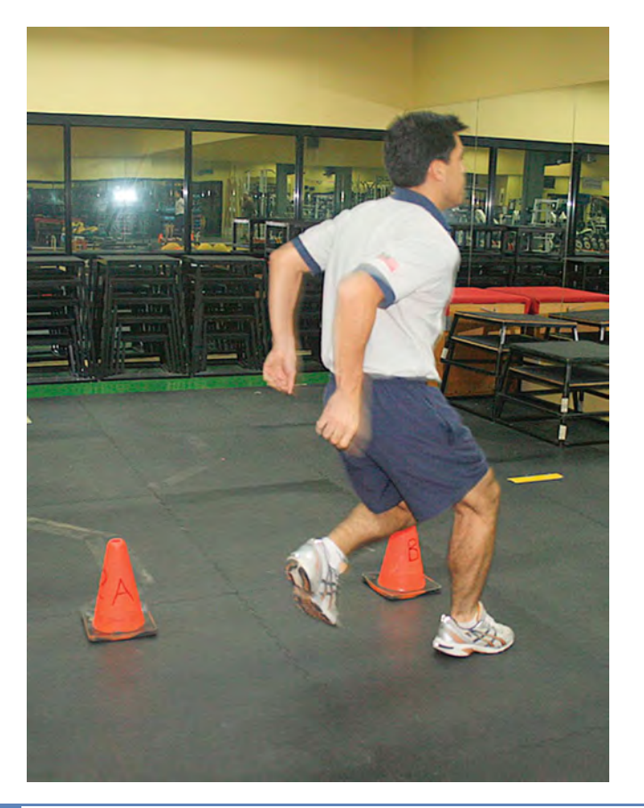
Figure 8. Lunge return hops. Start in an athletic position and hop forward for a distance of 3 shoe lengths (to start with). Upon landing explosively hop backwards with minimal ground contact time.

program. Before this it must be noted that the following program is based on the elite athlete who has a solid strength training background to such that they are able to tolerate maximal strength loads and ballistic training. The final phase of the analysis phase is the assessment of the individual athlete to determine their relative strengths and weaknesses in power, speed and force development in various movements. This performance analysis is critical to prioritizing goals and establishing starting loads to be used in training. Rather than enter into a detailed discussion of performance diagnosis we refer the interested reader to Newton and Dugan (9).