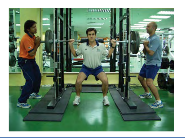
Figure 4. Wide stance concentric squat. As for normal squatting technique except the stance is wider to mimic the receiving position in match play. Spotters are necessary for the eccentric phase.

Multi direction lunges (Figure 7) performed rapidly are an ideal choice of exercise to use as they work on deceleration, body control and the turnaround phase which is actually a backward or sideways movement as opposed to most forward directed resistance training exercises.