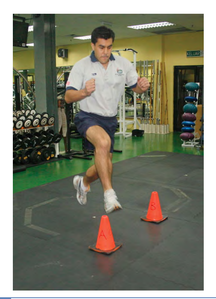
Figure 9. Plyometric drop back and jump. Start in between 2 cones 1 meter apart, jump backwards approximately two shoe lengths (to start with). Land on one leg and with minimal ground contact time explosively jump forward over either cone (to simulate forehand or backhand movement)

evaluation. The analysis of badminton has determined that there is a variety of strength qualities required for badminton specific performance and a variety