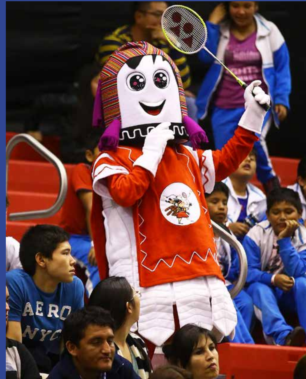
Mascot of the World Junior Championships 2015