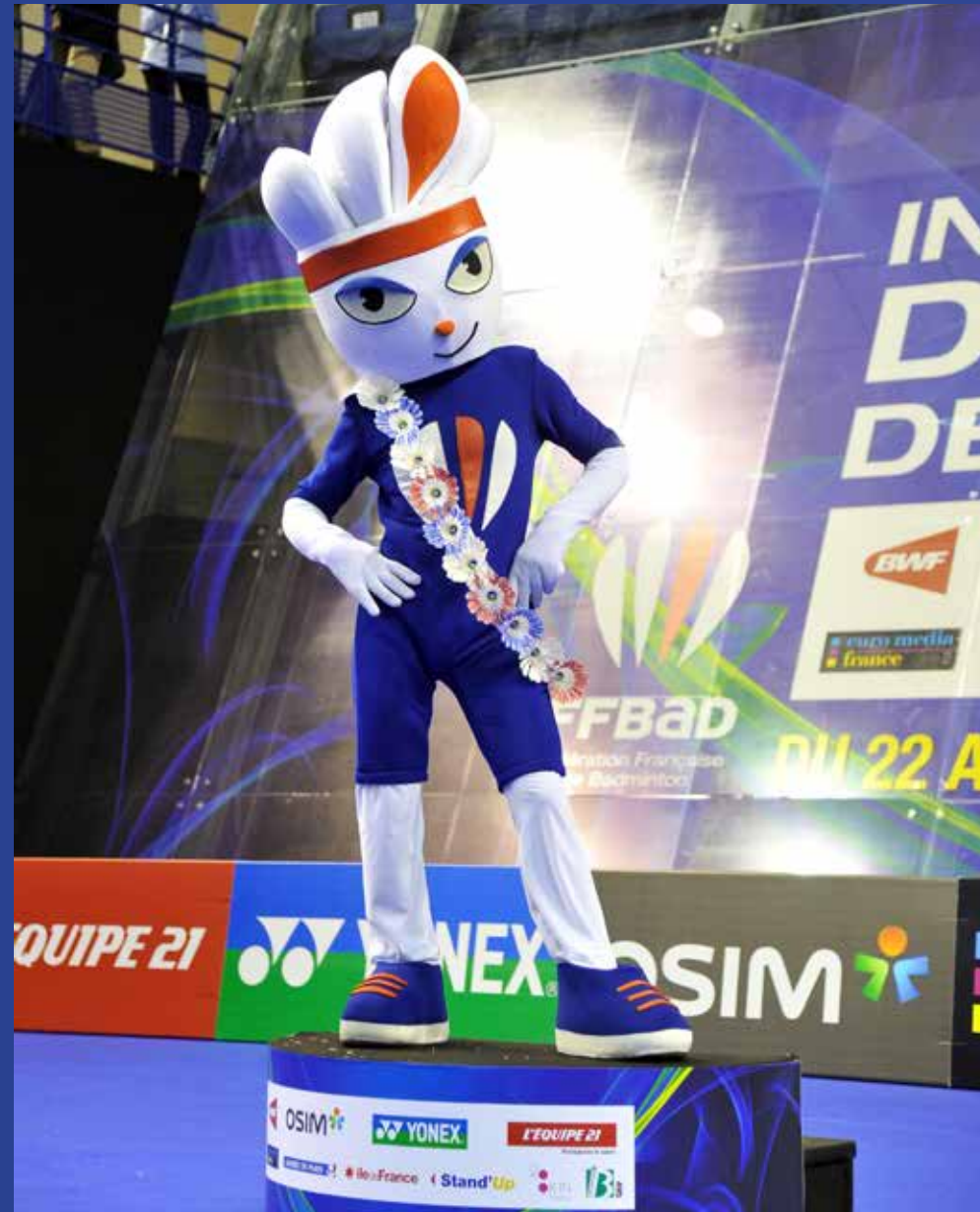
Mascot of the French Open Superseries